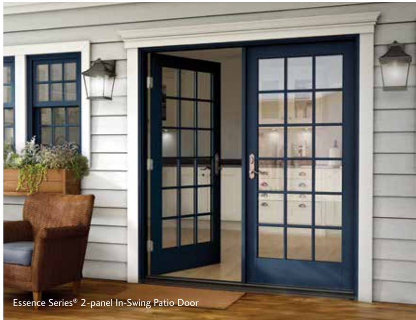
Essence Series® 2-panel In-Swing Patio Door